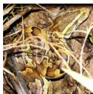
African Rock Python ( Itaa, Nzese, Nzatu )