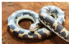
Sand Boa ( Kiinga )