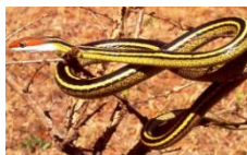
Speckled Sand Snake ( Muusyi )