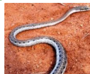
Link-Mark Sand Snake ( Kyenda ndeto )