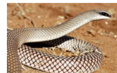
Rufous beaked Snake ( Ithangathi )